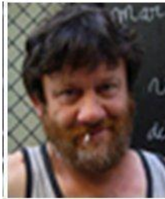
His working pose

Rabelaisian – yes, naughty but nice. I love this tasting note, you can almost hear the pan pipes in the background.